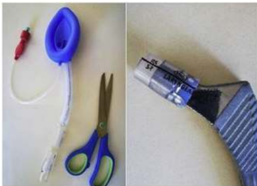
Figure 1. Silicon laryngeal airway #5 and its cut segment applied to the femoral taper.

We consider that the aforementioned procedure is an inexpensive and simple solution for the complicated problem and strongly recommend to be used during all liner exchange and acetabular cup-only revision total hip replacement surgeries.