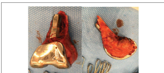
Figure 3: Sub periosteally resected distal femur