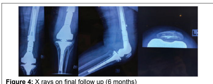
Figure 4: X rays on final follow up (6 months)

The suction drain and pain buster were removed after 48 hours without removing the dressing over the surgical wound. Patient was placed under supervised physiotherapy regimen for knee bending and muscle strengthening exercises. Partial weight bearing with extension knee splint and crutches was allowed from the first post operative day. Full weight bearing without knee splint was started after 2 weeks. At the last follow up (6 months) patient was walking unassisted with full weight bearing and the knee range of motion was 0 to 110 degrees. Wound has healed well without complications. But the patients have post traumatic arthritis of ipsilateral hip for which the surgery will be planned subsequently.