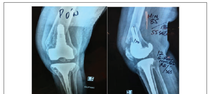
Figure 1: Peri prosthetic distal femur fracture (Lewis and Rorabeck type-II)

90 years active female presented to us with trivial fall from standing height with severe pain and swelling over left knee. She is in excellent health and very active with previous history of deep vein thrombosis (DVT). Radiograph showed Type II Lewis and Rorabeck supracondylar distal femur fracture (Figure 1). Patient had well fixed S-ROM stemmed knee implant with metaphyseal sleeves in situ which was implanted 27 years back after a complex revision total knee arthroplasty. But given the nature of the fracture and its extension around the femoral component,